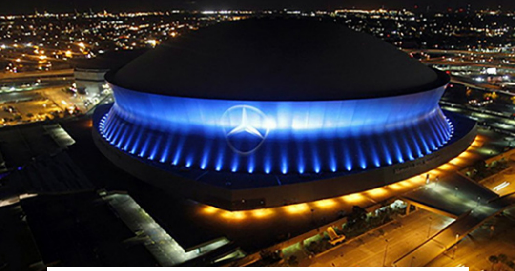
The Mercedes-Benz Superdome in New Orleans